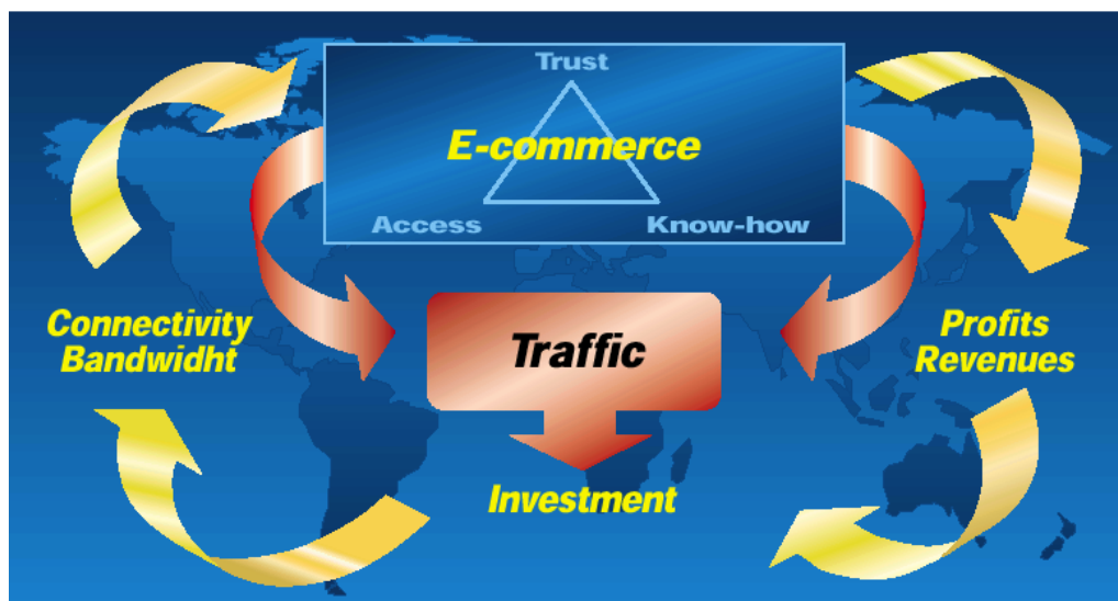
Figure 2: The Magic Triangle of E-Commerce